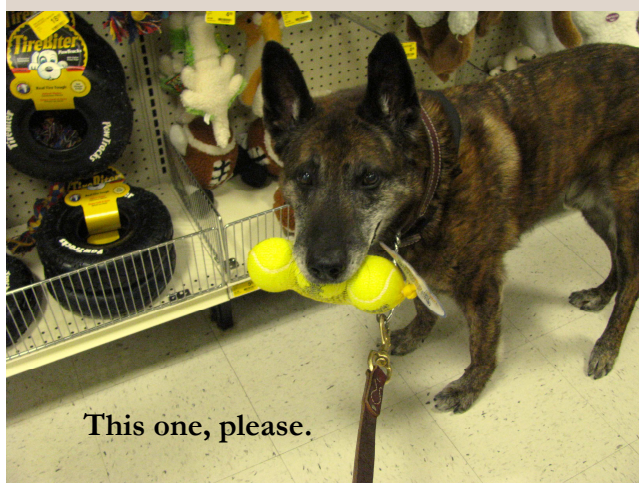
This one, please.

After the work of Seal Team Six, the waiting list has become longer, but you can check out adoption of MWDs at : http://www.lackland.af.mil/units/341stmwd/index.asp