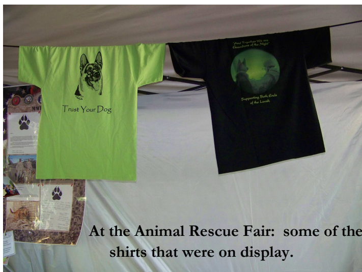
At the Animal Rescue Fair: some of the shirts that were on display.