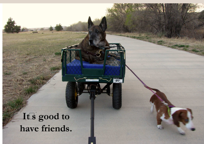
It's good to have friends.