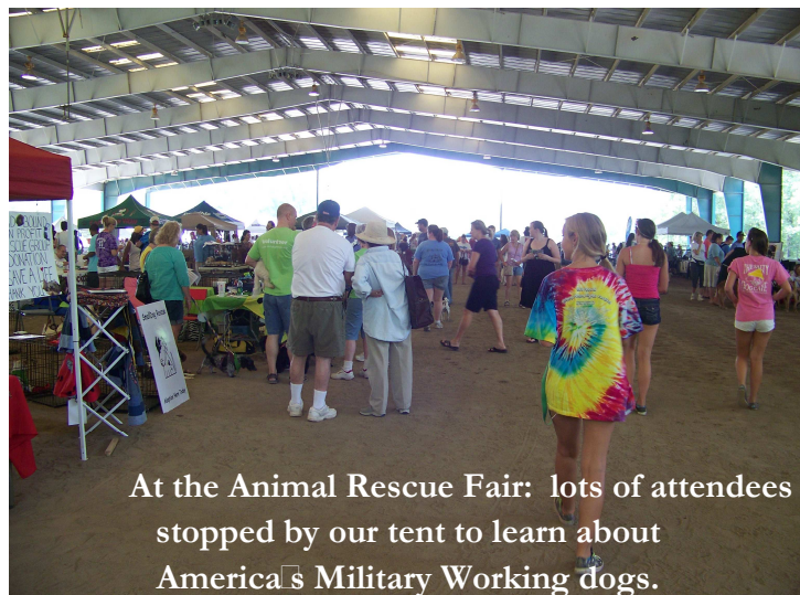
At the Animal Rescue Fair: lots of attendees stopped by our tent to learn about America's Military Working dogs.