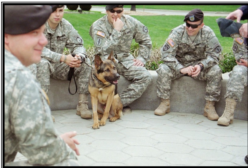
Handlers from Fort Stewart with Wero