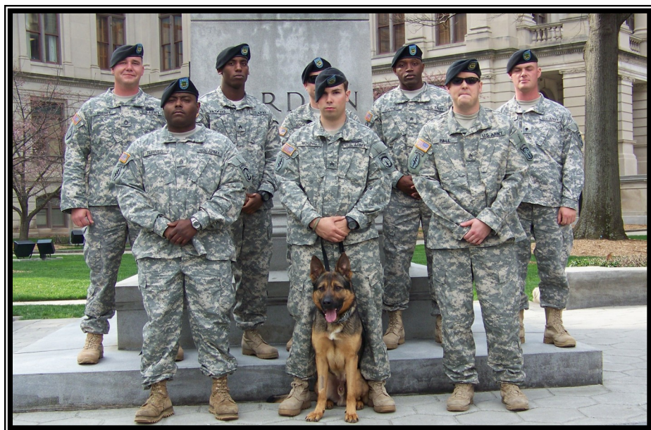
Ft. Stewart Handlers with Wero

Check out the mwdtsa.org blog for more photos of this day spent with the handlers.