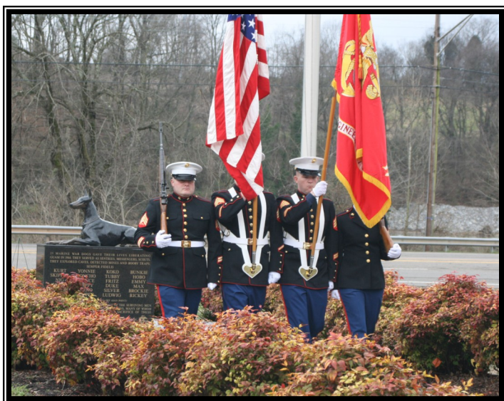
Marine Corps Color Guard at the University of Tennessee Marine War Dog Replica.

Imagine -Being on a scouting patrol in the jungle and feeling a sting on your leg and then you start to lose consciousness. Next