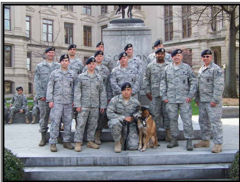
Handlers from Moody AFB with Rico