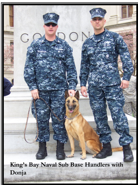
King's Bay Naval Sub Base Handlers with Donja