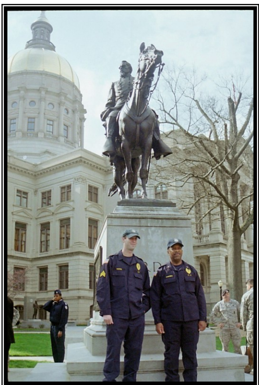
Handlers from Fort McPherson