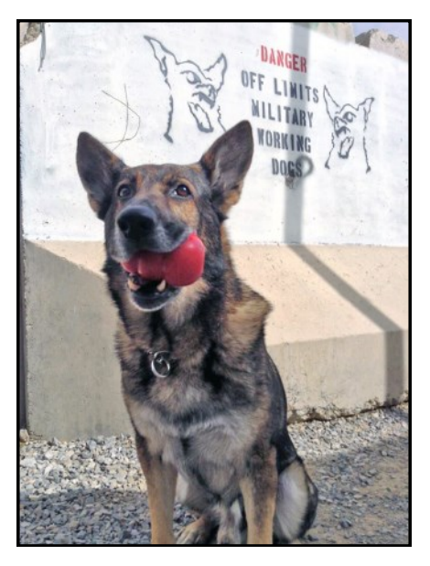
Above: Beny with his new KONG toy.