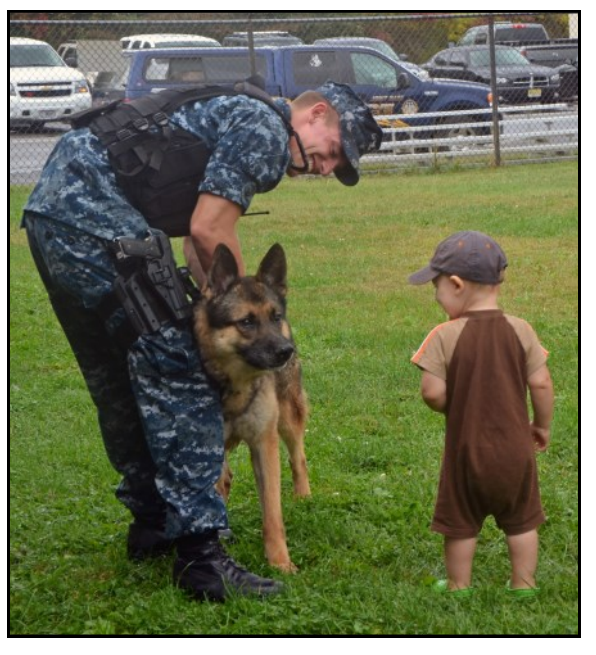
JBMDL Visit continued page 3

Below: All of the dogs were amazing and the handlers were so pleasant.