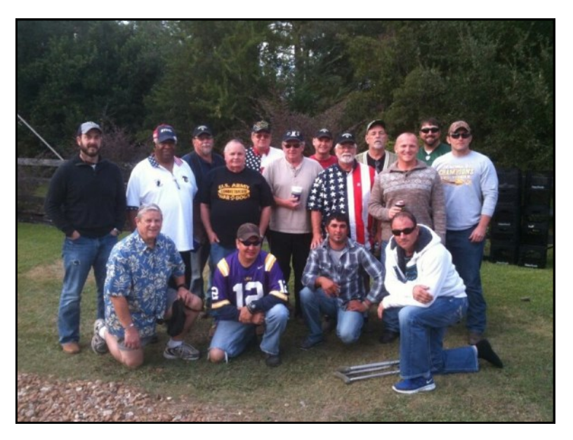
Reunion and Care Packaging continued on page 5

Above: A "Star Card" was included in each Q4 care package and presented to Irag and Vietnam veterans at the event. The cards were assembled by school children in Dallas, Ga., Gorman, Texas, Abingdon, Va. And Paterson, N.J.. Each "card" was signed by one of the volunteers.