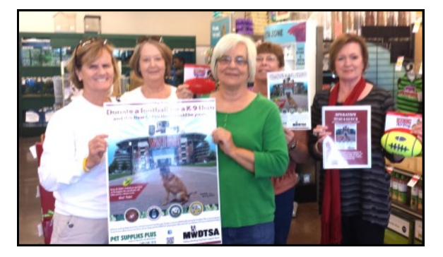
Above and Right: Pet Supplies Plus set up a display table featuring MWDTSA plus a patriotic end cap to publicize Operation Tusca-Lucca.